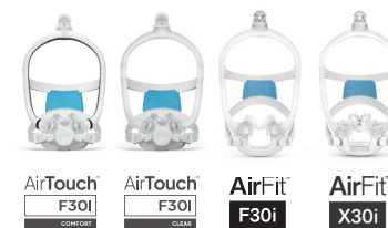
AirTouch™ F30i Comfort