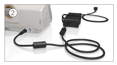
Plug the power connector into the rear of the device. Connect one end of the power cord into the power supply unit and the other end into the power outlet.