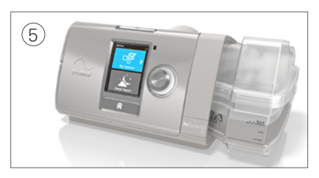
Close the water tub and insert it into the side of the device