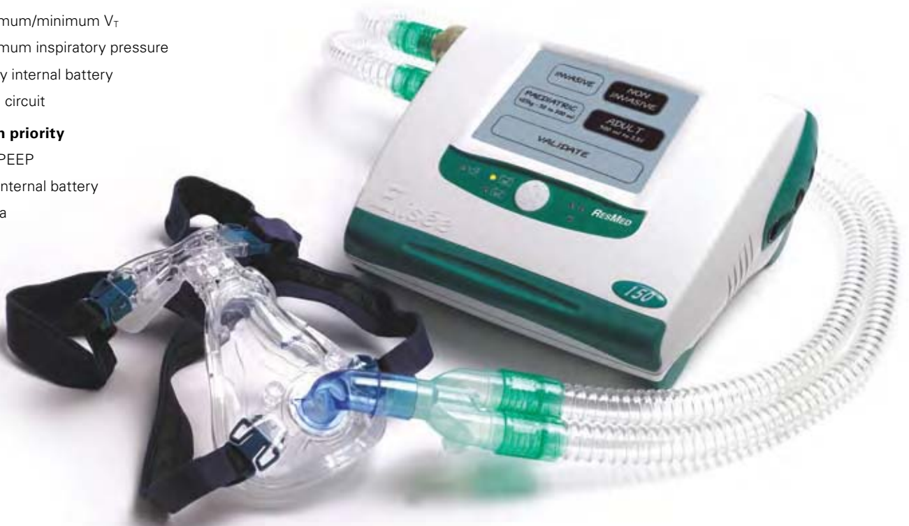
Elisée 150 can be used with ResMed non-vented masks for a comprehensive ventilation solution.