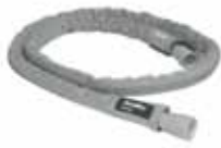
SlimLine Tubing Wrap 36811