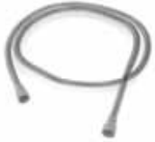
SlimLine™ Tubing 36810