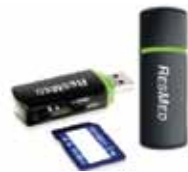
SD Card Reader 36931 • USB extension cable 7071015