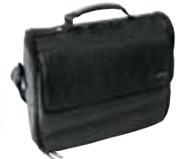
S9 Travel Bag 36860