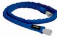
Standard Tubing Wrap 33963