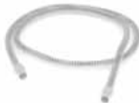
Standard Tubing 21948 • 2m Autoclavable: 14948