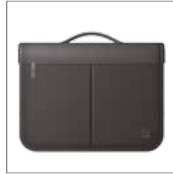
37304 Travel bag 37305 Travel bag for Her