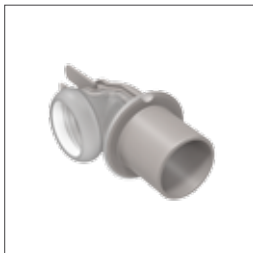
37310 Air outlet