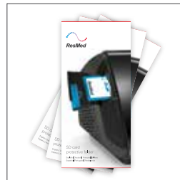
SD card protective folder 37329 with card (10 pk) 37330 without card (10 pk) 36931 SD card reader