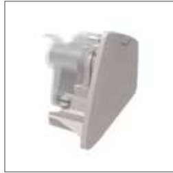
Side cover 37335 Gray (AutoSet for Her, AirCurve) 37303 Charcoal (CPAP, Elite, AutoSet)