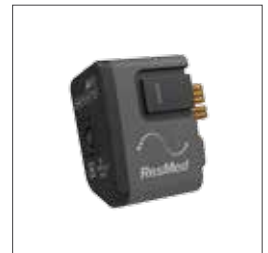
37302 Oximetry module* 22305 XPOD oximeter 707560 Reusable soft sensor (medium) – 3-meter cable 370004 Air 10 Oximetry Complete Kit: includes Oximetry Module, XPOD, XPOD clip, reusable soft sensor (medium)