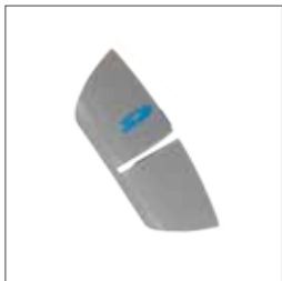
Side panel rubber SD card door 19766 Gray (AutoSet for Her, AirCurve) 19728 Charcoal (CPAP, Elite, AutoSet)