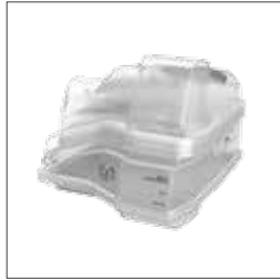
HumidAir heated humidifier 37300 Cleanable tub 37299 Standard tub