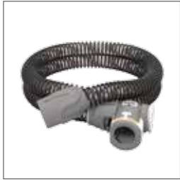
37296 ClimateLineAir heated tube 36810 SlimLine™ tube