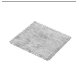
Filters – standard 36850 (1 pk) 36851 (2 pk) 36852 (12 pk) 36853 (50 pk) Filters – hypoallergenic 36855 (1 pk) 36856 (2 pk) 36857 (12 pk) 36858 (50 pk) Filter cover 19768 Gray (AutoSet for Her, AirCurve) 19729 Charcoal (CPAP, Elite, AutoSet)